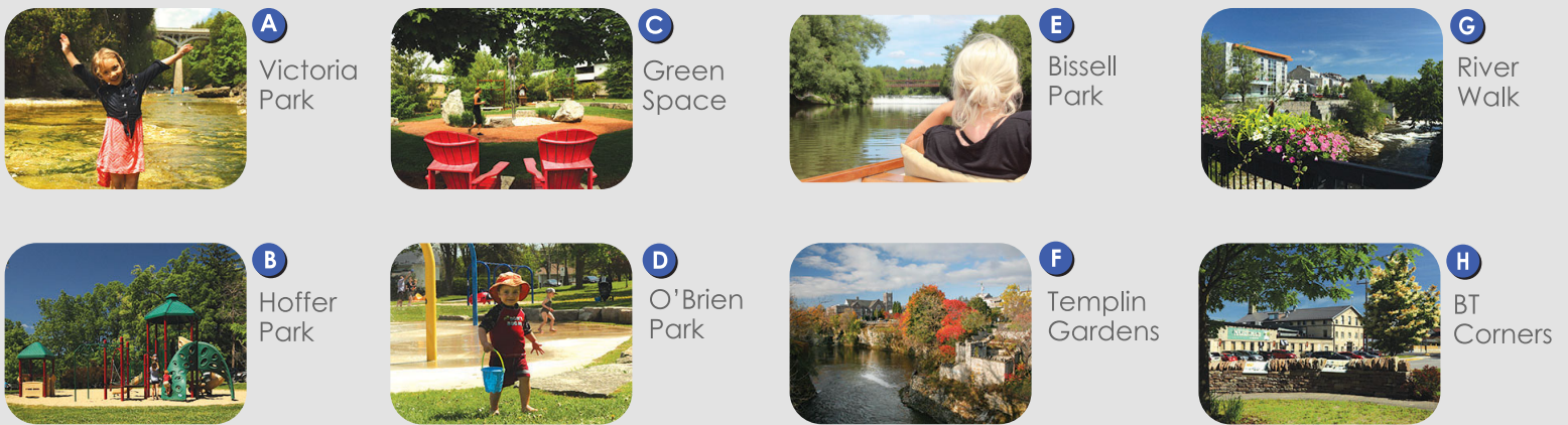
A Victoria Park